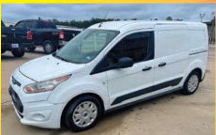
2016 FORD TRANSIT VN:292223 powered by gas engine, equipped with automatic transmission, power steering, 78,393 miles.