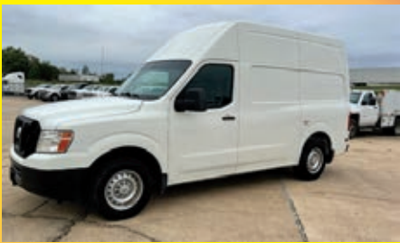
2019 NISSAN NV2500 VN:805881 powered by gas engine, equipped with automatic transmission, power steering, van body, 168,959 miles.