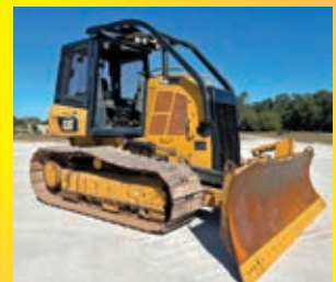
2018 CAT D4KLGP SN:KR202635 powered by Cat diesel engine, equipped with OROPS, 6 way blade, wide pads, 2,221 hours.