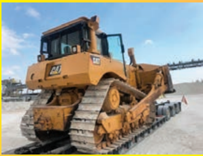
2005 CAT D8T Reconditioned, EROPS Cab w/ AC Et Heater ; 8SU Blade w/ Tilt Cylinder ; Carrier Rollers 28in. MS Shoes ; Rear Screen ; Counterweight ; Work Lights ; Radiator Guard.