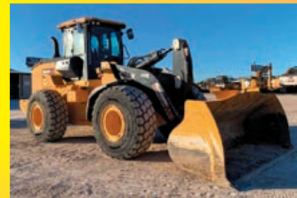
2023 JOHN DEERE 644P powered by diesel engine, equipped with EROPS, air, heat, hydraulic quick coupler, GP bucket, 1,068 hours.