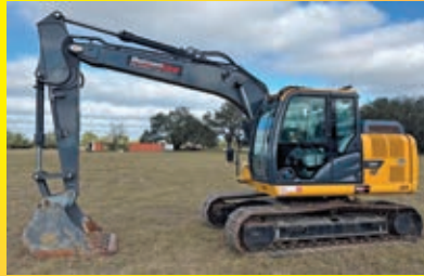
2023 JOHN DEERE 130P SN:000089 powered by John Deere diesel engine, equipped with Cab, air, heat, rear camera, 8ft 3in stick, auxiliary hydraulics, 24in pads, digging bucket, 479 hours.