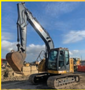
2023 JOHN DEERE 135G powered by John Deere diesel engine, equipped with Cab, air, heat, digging bucket, 735 hours.