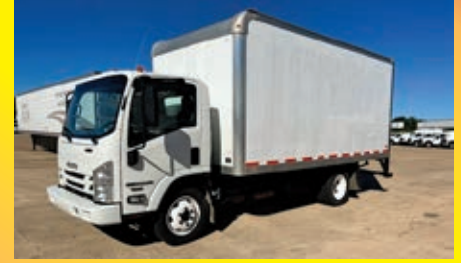
2019 ISUZU NPR VN:800803 powered by gas engine, equipped with automatic transmission, power steering, 275,349 miles.