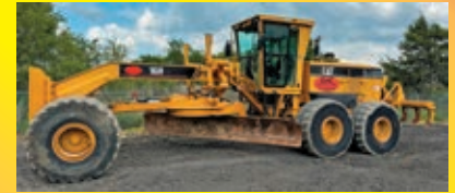
CAT 16H SN:ATS00385 powered by Cat diesel engine, equipped with EROPS, air, 16ft. blade, blade lift accumulators, push block, rear ripper, 23.5R25 rubber.