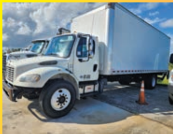
2016 FREIGHTLINER M2 VN:HH6693 powered by diesel engine, equipped with power steering, van body, dual wheel single axle.