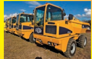
(14) NEW FIORI D50 4x4, powered by Kohler KDI 1903 TCR turbo intercooled diesel engine, 56hp, equipped with Cab, air, heat, hydrostatic transmission, rotating dump body, 3.6 yard heaped capacity, 11,023lb capacity, 4-wheel steering, 12-18 rubber. 1-year Full Warranty, 2,000 hours.