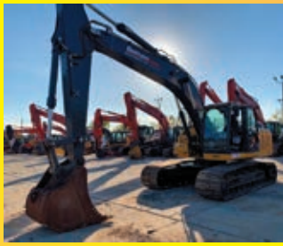
2023 JOHN DEERE 210G powered by John Deere diesel engine, equipped with Cab, air, heat, digging bucket, 1,458 hours.