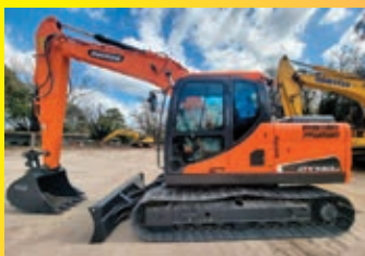
NEW DOOSAN DX140LC powered by diesel engine, equipped with Cab, air, heat, rear camera, front blade, auxiliary hydraulics, 24in. Pads, 36in. Digging bucket, long undercarriage.