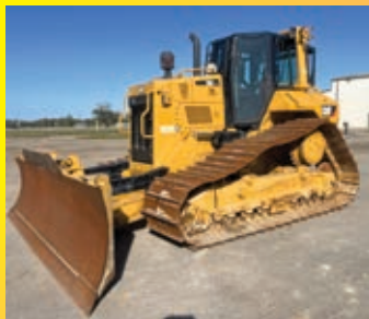
2019 CAT D6NLGP SN:SGG00553 powered by Cat diesel engine, equipped with EROPS, air, heat, 6 way foldable blade, 3,023 hours.