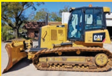
2018 CAT D6K2LGP powered by Cat diesel engine, equipped with EROPS, air, het, 6 way blade, Grade control, GPS ready, wide pads, 4,325 hours.