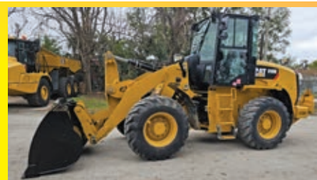
2020 CAT 910M SN:H2202412 powered by Cat diesel engine, equipped with EROPS, air, heat, auxiliary hydraulics, quick coupler, GP bucket, 36 hours.