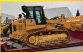
2024 CAT 963 SN:LTT01067 powered by Cat diesel engine, equipped with EROPS, air, heat, GP bucket w/ teeth, ripper valve, 112 hours.