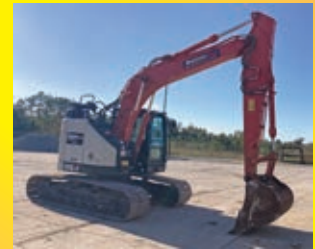
2023 LINKBELT 145X4 powered by diesel engine, equipped with Cab, air, heat, digging bucket, 1,462 hours.