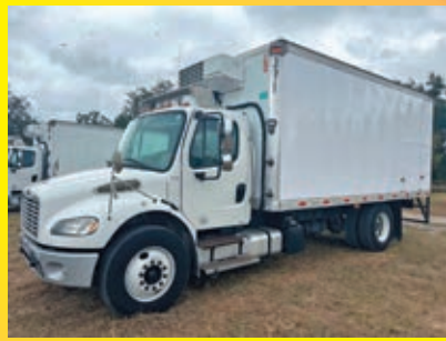
2015 FREIGHTLINER M2 VN:GC6044 powered by Cummins ISB diesel engine, equipped with Allison automatic transmission, power steering, 18ft. Van body, rear ramp, dual wheel single axle, 278,993 miles.