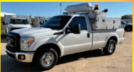
2011 FORD F250 VN:B58140 powered by gas engine, equipped with automatic transmission, power steering, crew cab, utility body, liftgate, air compressor, tool boxes, 136,657 miles.