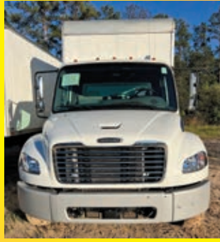
2020 FREIGHTLINER M2 VN:LS3376 powered by diesel engine, equipped with automatic transmission, power steering, 26ft. Van body, dual wheel single axle.