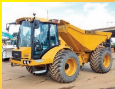
NEW UNUSED HYDREMA 912HM 4x4, powered by diesel engine, equipped with Cab, air, heat, 11 ton capacity, rotating dump body, 800/45-30.5 rubber.