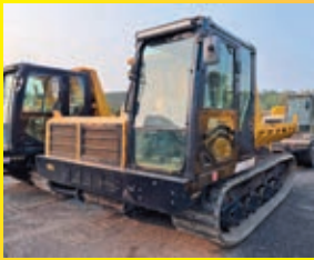
2019 MOROOKA MST2200VD SN:A2202225 powered by Cat C7.1 diesel engine, equipped with EROPS, air, heat, rear camera, flatbed dump body, track mounted, 3,750 hours.