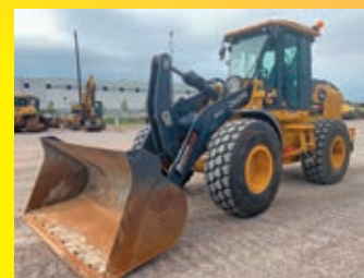
2023 JOHN DEERE 544P powered by John Deere diesel engine, equipped with EROPS, air, heat, 3rd valve hydraulics, JRB hydraulic quick coupler, GP bucket, floatation rubber, 673 hours.