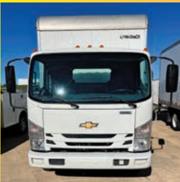
2020 CHEVY 4500XD VN:K00808 powered by diesel engine, equipped with automatic transmission, power steering, 16ft. Van body, dual wheel single 201,522 miles.