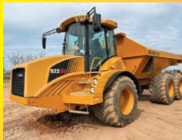
2018 HYDREMA 922HM powered by Cummins B6.7 diesel engine, 314hp, equipped with Cab, air, heat, 44,000lb capacity, tailgate, rear discharge, 800/45-30.5 rubber, 3,548 hours.