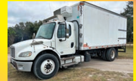
(3) 2015 FREIGHTLINER M2 powered by Cummins ISB diesel engine, equipped with Allison 2500HS automatic transmission, power steering, 18ft. Reefer body, Thermoking TK V520 reefer unit, dual wheel single axle.