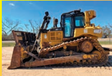
2011 CAT D6T-XW powered by Cat diesel engine, equipped with EROPS, Semi-U blade w/ tilt, waste handler, pull bar, new undercarriage, 9,113 hours.