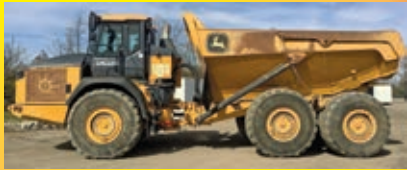
2021 JOHN DEERE 460E-II 6x6, powered by John Deere diesel engine, equipped with Cab, air, heat, rear camera, 46 ton capacity, tailgate, 6,051 hours.