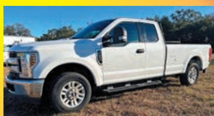
2018 FORD F250 VN:1FT7X2A6XJEC66297 4x4, powered by gas engine, equipped with automatic transmission, power steering, extended cab, liftgate, 88,011 miles.