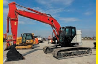
2021 LINKBELT 245X4 SN:LBX245Q7NKHEX1421 powered by diesel engine, equipped with Cab, air, heat, rear camera, 10ft. stick, auxiliary hydraulics, 32in. pads, digging bucket, 2,155 hours.