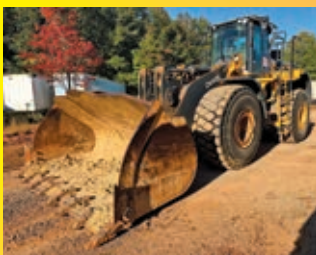
2020 JOHN DEERE 844L powered by John Deere diesel engine, equipped with EROPS, air, heat, rear camera, joystick steering, Loadrite on-board scale, 130in. GP bucket, 29.5R25 rubber, 8,830 hours.