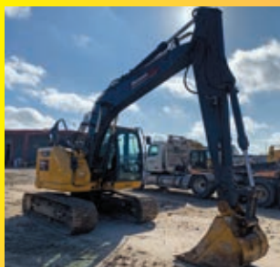
2023 JOHN DEERE 135G powered by John Deere diesel engine, equipped with Cab, air, heat, digging bucket, 971 hours.