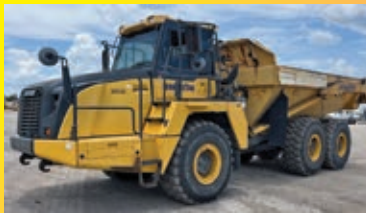
2015 KOMATSU HM300-5 6x6, powered by Komatsu diesel engine, 333hp, equipped with Cab, air, heat, rear camera, traction control, 30 ton capacity, tailgate, 23.5R25 rubber.