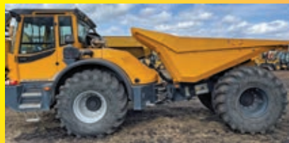
2020 BERGMANN C815S 6x6, powered by diesel engine, equipped with Cab, air, heat, rear camera, 26,455lb capacity, 1,693 hours.