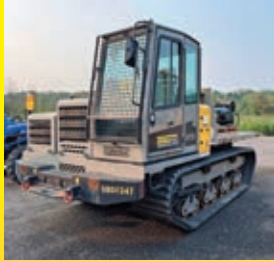
2019 TERRAMAC RT9 SN:9H00347 powered by diesel engine, equipped with EROPS, air, heat, rear view camera, 12ft. flatbed dump body, 28in. Rubber tracks, 631 hours.