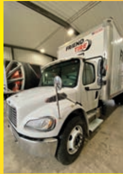
2019 FREIGHTLINER M2 VN:KH5101 powered by diesel engine, equipped with automatic transmission, power steering, 26ft. Van body, dual wheel single axle.