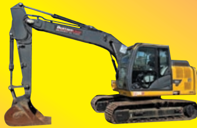
2023 JOHN DEERE 130P SN:000086 powered by John Deere diesel engine, equipped with Cab, air, heat, rear camera, 8ft 3in stick, auxiliary hydraulics, 24in pads, digging bucket, 542 hours.