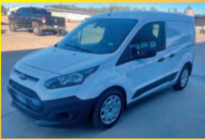
2018 FORD TRANSIT VN:358205 powered by gas engine, equipped with automatic transmission, power steering, van body, 88,634 miles.