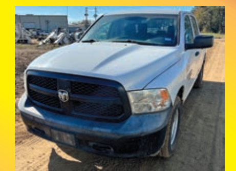
2019 DODGE RAM 1500 VN:517921 4x4, powered by gas engine, equipped with automatic transmission, power steering, crew cab, 136,144 miles.