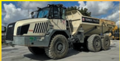
2021 TEREX TA300 30 Ton ; Air Conditioned Cab w/ Heater ; 6X6 ; 23.5R 25 Radial Tires ; Steel Body Liner ; Rear View Camera ; Work Lights & Mirrors ; Tailgate, 2,484 hours.