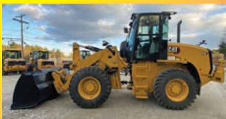
2022 CAT 910 powered by Cat diesel engine, equipped with EROPS, air, heat, rear camera, ride control, 3rd & 4th valve hydraulics, hydraulic quick coupler, 2.2 yard GP bucket, 16.9-24 rubber.