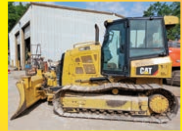
2020 CAT D5K2LGP powered by Cat diesel engine, equipped with EROPS, air, heat, rear camera, autolube, hydstat transmission, 10ft. 4in. 6 way blade, 26in. pads, drawbar, pre-wired for grade control, System One undercarriage, 6,024 hours.