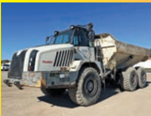
2015 TEREX TA300 6x6, powered by diesel engine, equipped with Cab, air, heat, rear camera, engine retarder, 30 ton capacity, body liner, 23.5R25 rubber, 7,974 hours.