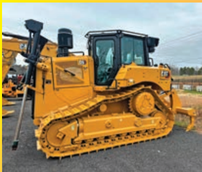
NEW UNUSED CAT D6 powered by Cat diesel engine, equipped with EROPS, air, heat, SU blade, 3D grade control, multi-shank rear ripper.