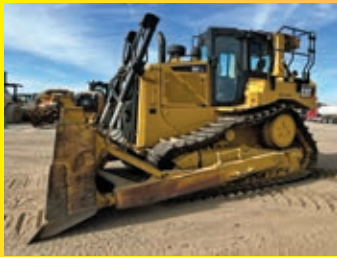
2020 CAT D6TXL powered by Cat diesel engine, equipped with EROPS, air, heat, 125in. Semi-U blade w/ tilt, front Et rear auxiliary hydraulics, 24in. pads, Grade Control Ready, counterweight, drawbar, long track frame, 4,082 hours.