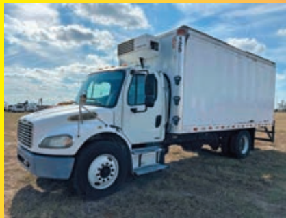
(3) 2010 FREIGHTLINER M2 powered by Cummins ISB diesel engine, equipped with Allison 2500HS automatic transmission, power steering, 18ft. Reefer body, Thermoking TK V520 reefer unit, dual wheel single axle.