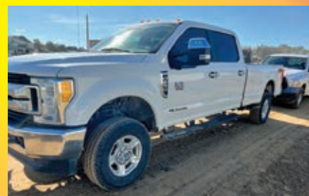
2017 FORD F250 VN:C51136 4x4, powered by diesel engine, equipped with automatic transmission, power steering, crew cab, 257,321 miles.