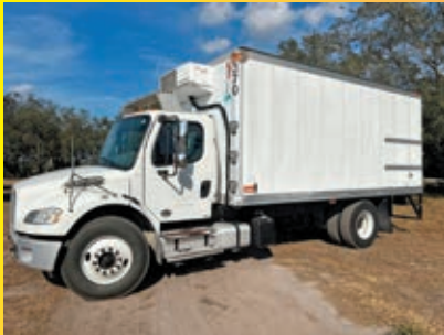
2015 FREIGHTLINER M2 VN:GC6043 powered by Cummins ISB diesel engine, equipped with Allison automatic transmission, power steering, 18ft. Van body, rear ramp, dual wheel single axle, 260,127 miles.