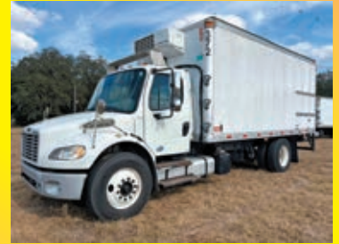
(8) 2018 FREIGHTLINER M2 powered by Cummins ISB diesel engine, equipped with Allison 2500HS automatic transmission, power steering, 18ft. Reefer body, Thermoking TK V520 reefer unit, dual wheel single axle.