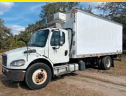
2014 FREIGHTLINER M2 VN:FR1248 powered by Cummins ISB diesel engine, equipped with Allison automatic transmission, power steering, 18ft. Van body, rear ramp, dual wheel single axle.