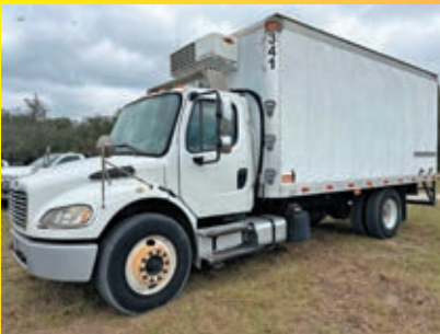
(3) 2014 FREIGHTLINER M2 powered by Cummins ISB diesel engine, equipped with Allison 2500HS automatic transmission, power steering, 18ft. Reefer body, Thermoking TK V520 reefer unit, dual wheel single axle.