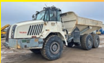
2014 TEREX TA300 6x6, powered by diesel engine, equipped with Cab, air, heat, rear camera, engine retarder, 30 ton capacity, body liner, 23.5R25 rubber, 8,693 hours.