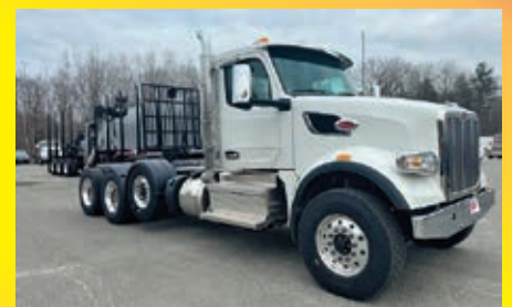
2025 PETERBILT 567 powered by Cummins X15 diesel engine, 565hp, equipped with 18 speed transmission, power steering, a/c, 2-line wet system, fenders, 70 ton 5th wheel, 20,000lb fronts, 20,000lb pusher, 46,000lb rears, full lockers, New Way air ride suspension, 315/22.5 front and pusher tires, 11R24.5 rear tires, triaxle. FET has been paid. Manufacturer's Warranty.