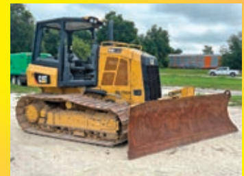
2018 CAT D4KLGP SN:KR202606 powered by Cat diesel engine, equipped with OROPS, 6 way blade, wide pads, 2,582 hours.