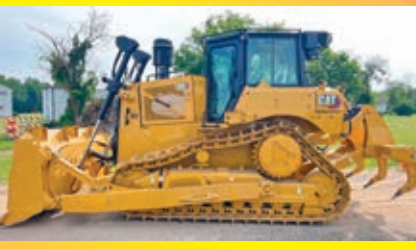
NEW UNUSED CAT D6 powered by Cat diesel engine, equipped with EROPS, air, heat, SU blade, 22in pads, rear ripper, 3D grade control.