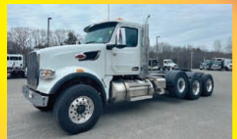
2025 PETERBILT 567 powered by Paccar MX diesel engine, 510hp, equipped with 18 speed transmission, power steering, a/c, 46,000lb rears, full lockers, 11R24.5 tires, tandem axle. FET has been paid. Manufacturer's Warranty.

2025 PETERBILT 589 VN:NA powered by Cummins X15 diesel engine, 605hp, equipped with Eaton Fuller RTLO2091813 18 speed transmission, power steering, premiere alpine gray interior, 100 gallon right side split tank (50 gallon fuel tank, 50 gallon hydraulic tank), 60 gallon left side fuel tank, 72in. Holland severe duty slide fifth wheel, Dana Spicer D46-172 46,000lb rears, 3.73 ratio, air trac 46,000lb 54in. spacing, Watson & Chalin SL13 pusher lift axle, high polished Ultra one technology aluminum rims, Michelin 11R24.5 X-line energy front tires, Michelin 255/70R22.5 XZE pusher tires, Michelin 11R24.5 rear tires, triaxle. Pearl white w/ black frame. Peterbilt standard truck warranty 1 year / 100,000 miles, Electrical extended warranty (includes DEF system) 4 years / 500,000 miles, Cummins Series X15 Performance engine warranty (major components & driveline) 4 years / 400,000 miles. FET TAX has been Paid