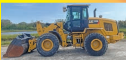
2015 CAT 930M powered by Cat diesel engine, equipped with EROPS, air, heat, Cat Fusion quick coupler, 3 yard 108in. GP bucket.