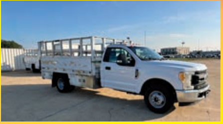
2017 FORD F350 VN:E28272 powered by gas engine, equipped with automatic transmission, power steering, cage utility body, liftgate, dual wheel single axle, 182,743 miles.