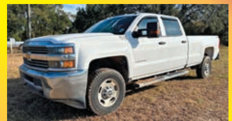
2018 CHEVY 2500 VN:1GC1KUEG5JF160045 4x4, powered by gas engine, equipped with automatic transmission, power steering, crew cab, 201,390 miles.