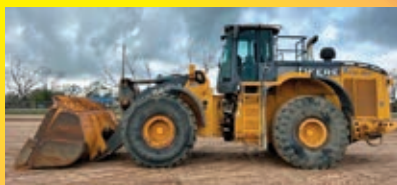
2014 JOHN DEERE 844K-II powered by John Deere diesel engine, equipped with EROPS, air, heat, GP bucket, 29.5R25 rubber.