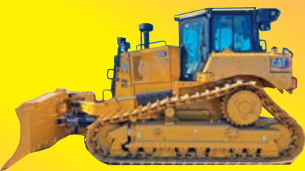
(2) NEW UNUSED CAT D6LGP powered by Cat diesel engine, equipped with EROPS, air, heat, rear camera, 6 way blade, wide pads, ripper valve, drawbar, ARO ready.