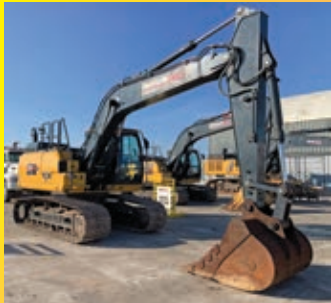
2023 JOHN DEERE 160P powered by diesel engine, equipped with Cab, air, heat, auxiliary hydraulics, digging bucket, 943 hours.