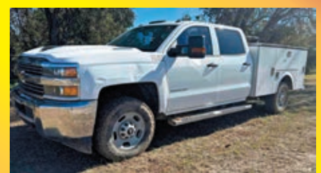
2018 CHEVY 2500 VN:1GC1KUEY6JF168860 4x4, powered by gas engine, equipped with automatic transmission, power steering, crew cab, tool boxes, 188,619 miles.