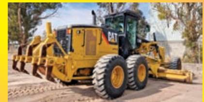
CAT 14MVHP SN:LR9J00408 powered by Cat diesel engine, equipped with EROPS, air, heat, Variable Horse Power, 16ft. Moldboard, hydraulic sideshift, TIP control, push block, rear ripper, new rubber.