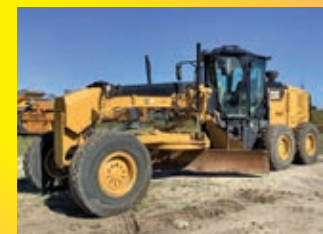
2020 CAT 12M3 powered by Cat diesel engine, equipped with EROPS, air, heat, rear camera, joystick steering, differential lock, 14ft. Moldboard, hydraulic sideshift, TIP control, 14.00-24 rubber, 5,011 hours.