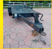
500 GALLON VN:N/A with fuel pump, triaxle.