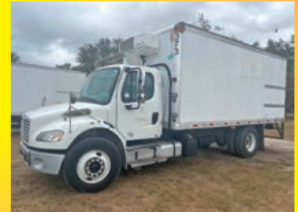
2015 FREIGHTLINER M2 VN:GC6046 powered by Cummins ISB diesel engine, equipped with Allison automatic transmission, power steering, 18ft. Van body, rear ramp, dual wheel single axle, 249,183 miles.