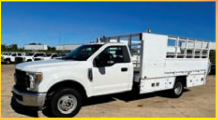
2018 FORD F350 VN:C11909 powered by gas engine, equipped with automatic transmission, power steering, 195,568 miles.