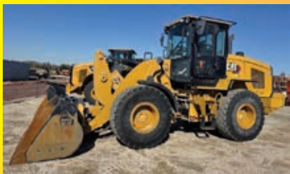
2022 CAT 930M powered by Cat diesel engine, equipped with EROPS, air, heat, rear camera, ride control, AG handler arrangement, 3rd valve hydraulics, Fusion hydraulic quick coupler, 3.5 yard GP bucket, 20.5R25 rubber, 5,594 hours. 72in. Forks Sell Separately.