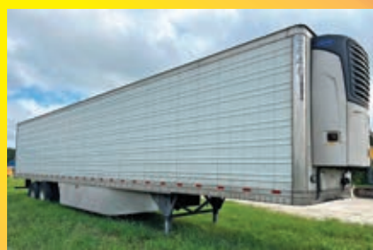
2019 HYUNDAI VN:3H3V532C3LT070148 equipped with 53ft. refer body, Carrier 7300 refer unit, air ride suspension, 295/75R25 tires, tandem axle.