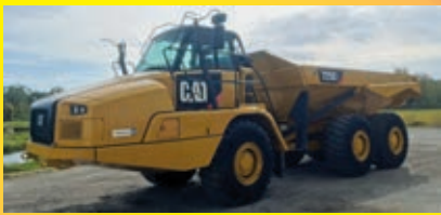
(2) 2019 CAT 725C2 6x6, powered by Cat diesel engine, equipped with Cab, air, heat, rearview camera, 25 ton capacity, tailgate, 23.5R25 rubber.