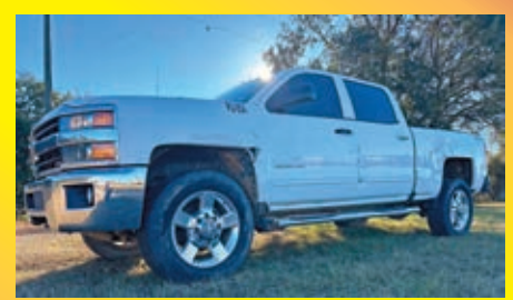
2018 CHEVY 2500 VN:167888 4x4, powered by Duramax diesel engine, equipped with Allison automatic transmission, crew cab, power steering, 205,164 miles.