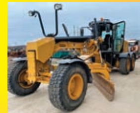
2016 CAT 140M3 SN:N9M00381 powered by Cat diesel engine, equipped with EROPS, air, heat, 14ft. Moldboard, hydraulic sideshift, TIP, Base & four hydraulics, Grade control Cross-slope, 17.5R25 rubber.