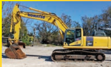
2015 KOMATSU PC360LC-11 powered by Komatsu diesel engine, equipped with Cab, air, heat, auxiliary hydraulics, 34in. Pads, 60in. Digging bucket, long undercarriage, 6,169 hours.