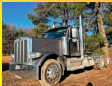
2025 PETERBILT 589 powered by Cummins X15 diesel engine, 565hp, equipped with 18 speed transmission, power steering, a/c, 46,000lb rears, full lockers, air ride suspension, 11R24.5 tires, tandem axle. FET has been paid. Manufacturer's Warranty.