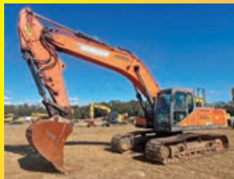
2019 DOOSAN DX350LC-5 SN:20285 powered by diesel engine, equipped with Cab, air, heat, 11ft stick, auxiliary hydraulics, 34in pads, digging bucket, long undercarriage.