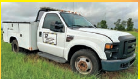
2008 FORD F350 VN:E17672 powered by diesel engine, equipped with automatic transmission, utility body, dual rear wheels.