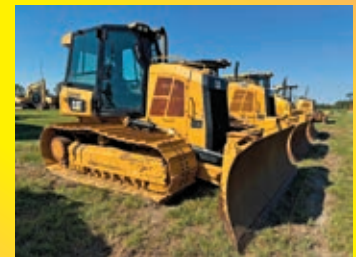
2018 CAT D5K2LGP SN:KY203791 powered by Cat diesel engine, equipped with EROPS, air, heat, rear screen, 6 way blade, wide pass, Accugrade ready, Grade Control, New Cat Undercarriage,