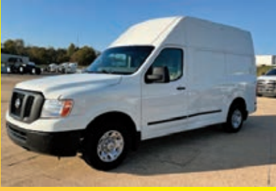
2021 NISSAN NV2500 VN:801374 powered by gas engine, equipped with automatic transmission, power steering, van body, 133,014 miles.