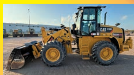
2020 CAT 910M SN:H2202237 powered by Cat diesel engine, equipped with EROPS, air, heat, GP bucket, 791 hours.