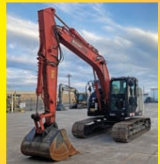
2023 LINKBELT 145X4 SN:HEX2706 powered by diesel engine, equipped with Cab, air, heat, rear camera, 10ft stick, auxiliary hydraulics, 24in pads, coupler hydraulics, digging bucket, 989 hours.